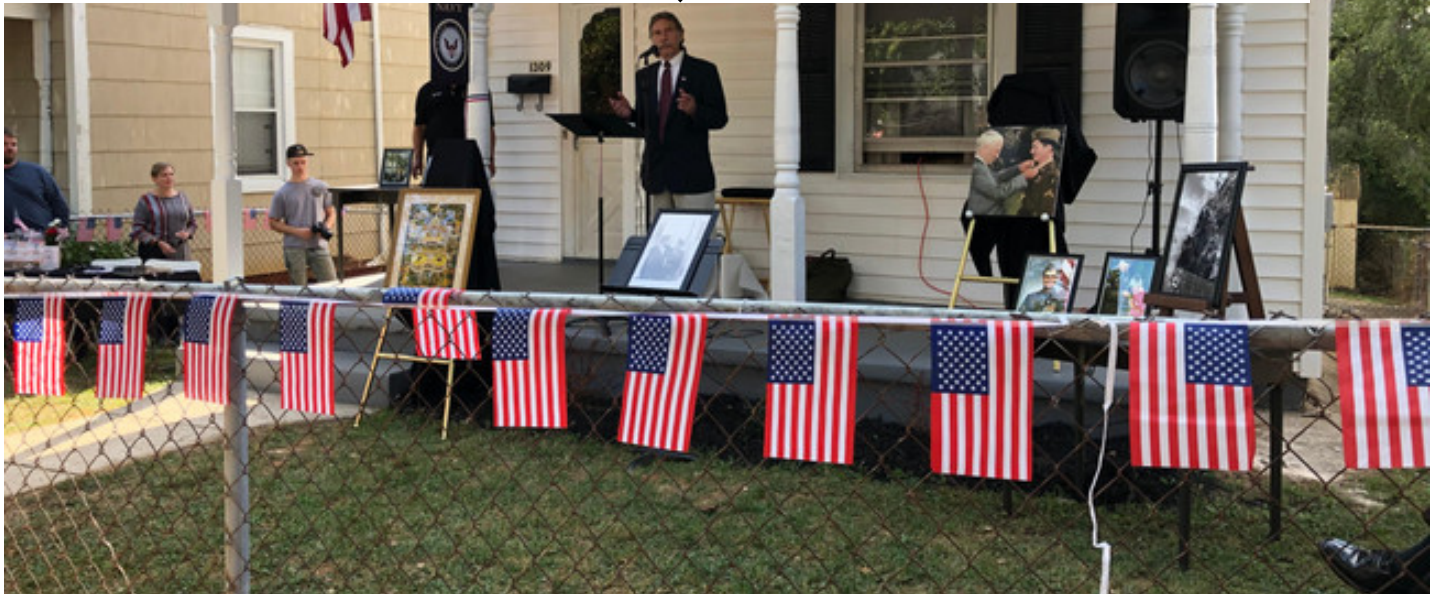
The former home of Desmond T. Doss in Lynchburg has now been converted into a home for homeless veterans in the area

Lynchburg Mayor Treney Tweedy even declared October 12 as Desmond T. Doss day each year in the City of Lynchburg.