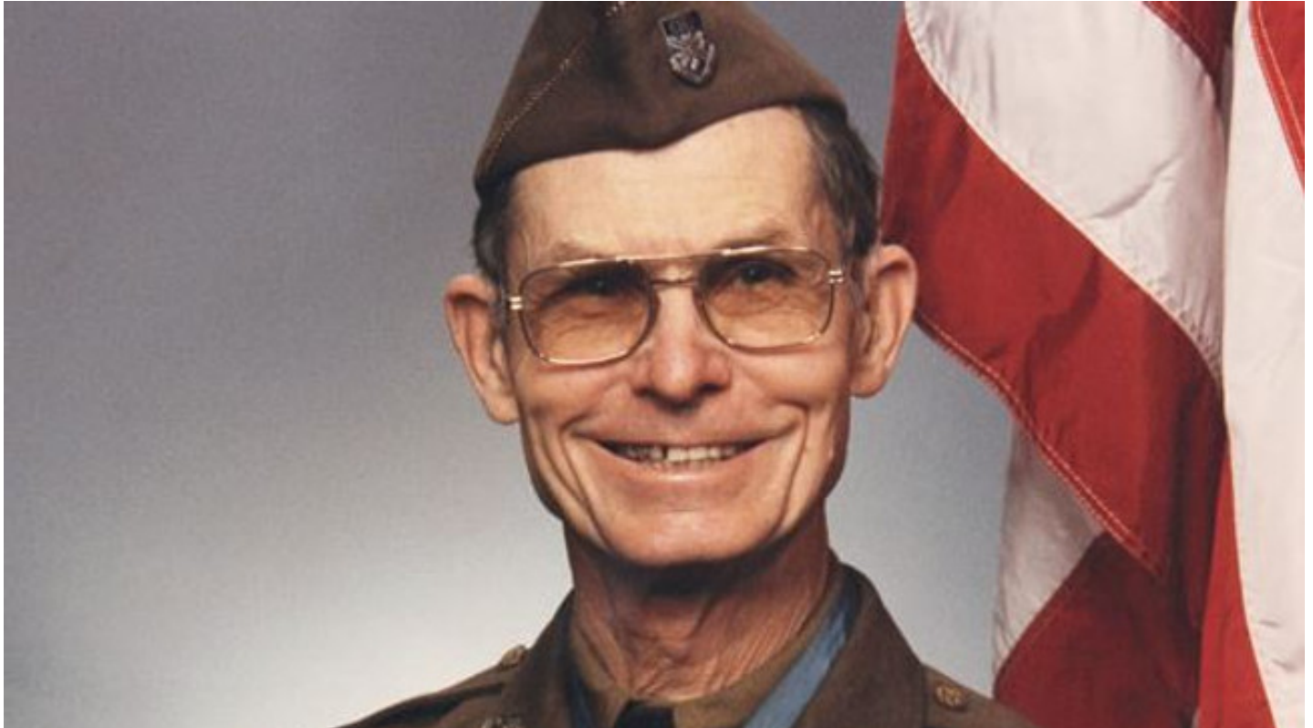
Desmond Doss (Desmond Doss Council)

Desmond T. Doss was a United States Army corporal who served as a combat medic in World War II after growing up in Lynchburg.