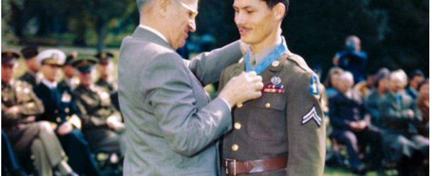
Desmond Doss receives the Medal of Honor by Harry Truman in 1945